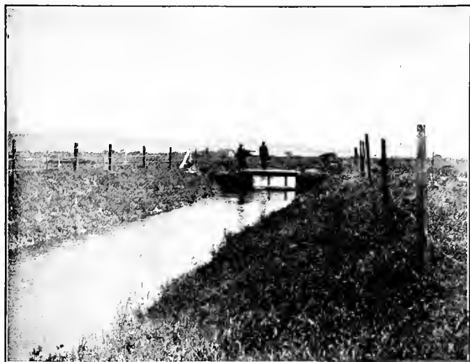
IRRIGATION DITCH, FORT ROMIE.